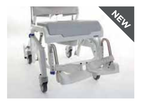
Shortened Leg Rests

Can be used to support abnormal posture or smaller/ young adults.